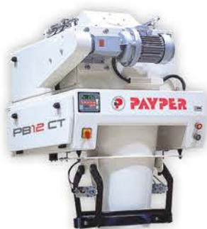
PB12 Simple installation, low maintenance.

Gross scales with different dosing systems according to product properties, can be implemented with an automatic bag placer or manual bagging spout. Capacity up to 600 cycles/hour of 25 kg.