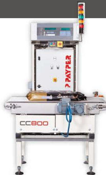
CC800 In-line checkweigher with electronic weight controller mod. SCB01. For unit loads up to 50 kg.