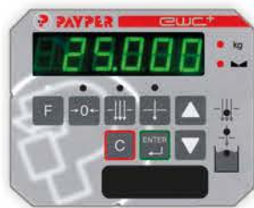
EWC+ Digital weight controller. Easy to use.