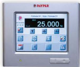
MCB+ Touch-screen weight controller. High performances.