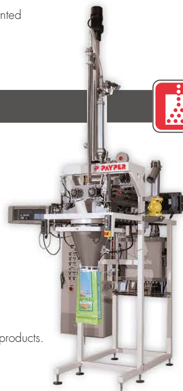
PB15 Specially designed for handling difficult products.

Gross scales with different dosing systems according to product properties, can be implemented with an automatic bag placer or manual bagging spout. Capacity up to 600 cycles/hour of 25 kg.